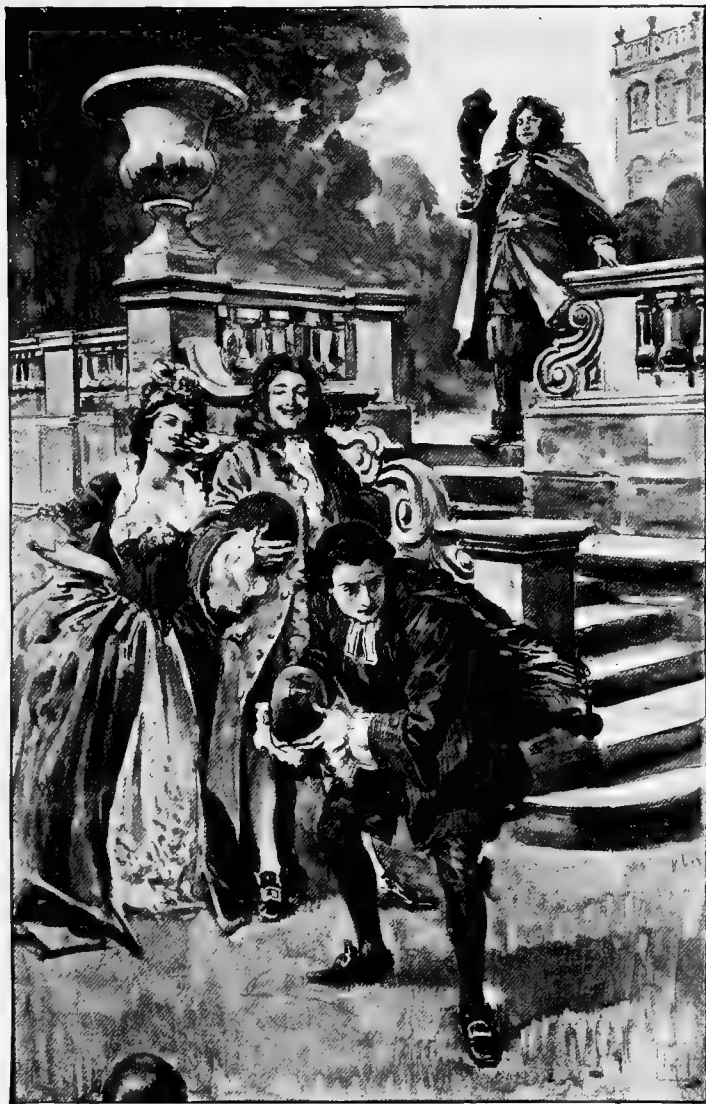
"The arrival of Sir Marmaduke was a relief."